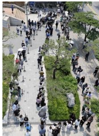
Voters waiting in line to cast their ballots during early voting